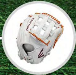
Pro Collection Fastpitch Ball Glove