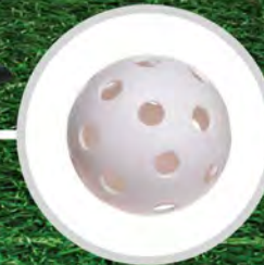
Plastic Training Ball