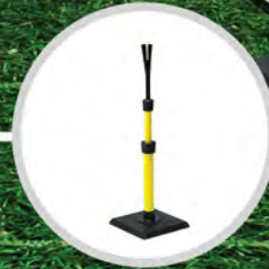
Square It Up Tee