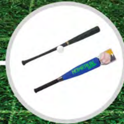
Pro Stix Training Set or Foam Bat & Ball Set