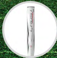
Ghost ® Advanced